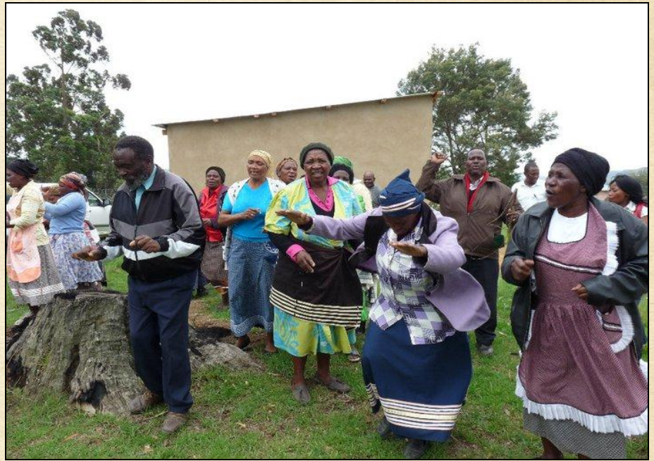
Members of Nsiken community dancing during goat delivery

"I am very grateful to Heifer International South Africa because now I am a better